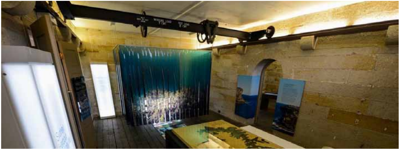
The “Harbour Room” at SIMS Discovery Centre. 3-d model of Sydney Harbour in the foreground and 3-d virtual dive facility behind the curtain of kelp.

The historic sandstone mine labs at the foreshore of Chowder Bay are the perfect backdrop for the new SIMS Discovery Centre, which has been more than a year in the making and is about to open its doors! The two historic rooms (which used to house naval mines) have been fitted out with a series of beautiful displays that showcase what SIMS is all about – research of the marine, coastal and estuarine environment. The impacts of human activities on our coasts and oceans are at the heart of much of SIMS’ research and the new centre.