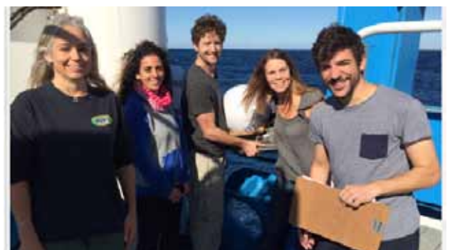
On board the RV Investigator with the team about to deploy the Lagrangian Drifter which is a piece of equipment that can either float on the surface or at a specific depth to collect data about the current.

The team used high-tech equipment on Australia's new research vessel, the RV Investigator , to measure temperature, salinity and type of plankton in the small eddies to determine if they are offshore nursery grounds. If it is found that the small eddies are good for larval fish, it raises the possibility of putting eggs from big fish such as tuna into the eddies to help repopulate the ocean.